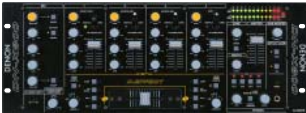
DN-X800 PROFESSIONAL Digital/Analog DJ Mixer with X-EFFECT