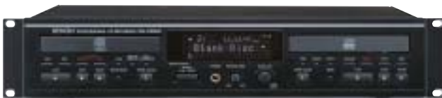
DN-C550R PROFESSIONAL CD-R/RW Recorder